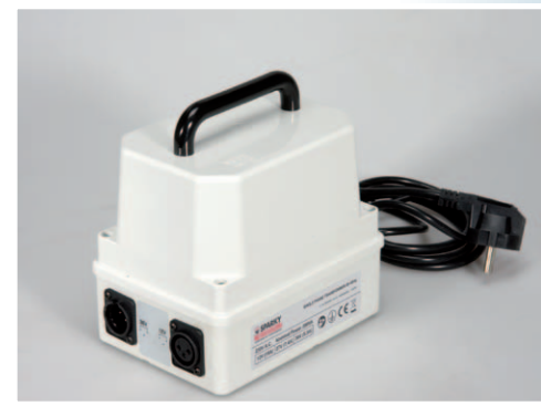
Dual power transformer 36V and 12V

Additional hand held tool for intricate cuts and shapes i.e. holes for pipes joists and cabling