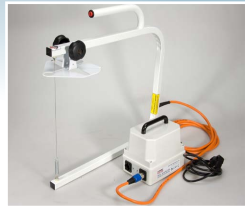
SPARKCUT 22/40 - 12V

Hot wire tool for accurately cutting and shaping Polystyrene foam sheets and blocks